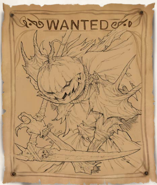
Scarecrow Bounty Poster